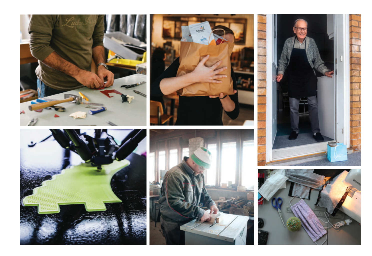
Example images of some of the skills/services that can be used for trading and volunteeing.